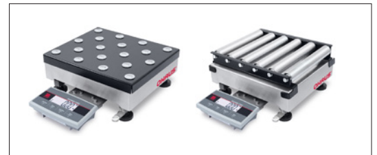
Ball Top and Roller Top Platform Options

Provides simple averaging of weights for unstable loads.